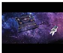
Back to the basics