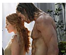
24 Must-See Movies for Summer 2016 (AARP)