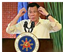
Duterte eyes talk with China over unclaimed corpses (Headlines)