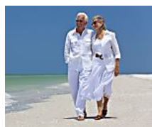
Want to Retire Comfortably? Here's Ways to Get It Done [Free Guide] (Fisher Investments)