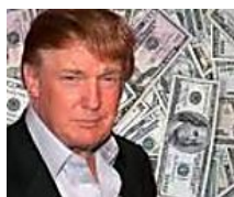
Donald Trump's Advice For Paying Off Mortgage (It's Genius) (New Daily Finance)