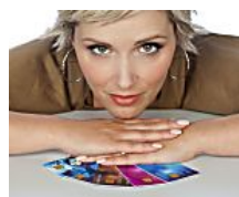
4 Credit Cards Charging 0% Interest Until 2018 (NextAdvisor)