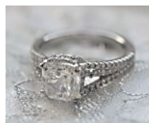
9 Engagement Rings That Have Details People Don't Notice (Brilliant Earth)