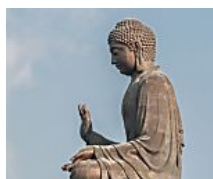
[Content Marketing] - What Should You Focus on First? (Outbrain Blog)