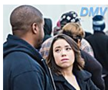
United States Residents Born Between 1936 and 1966 Are In For A Big Surprise (LiveSmarterDaily)