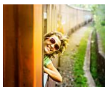
Planes, trains and automobiles – save $$ on your travel plans (Liligo.com)